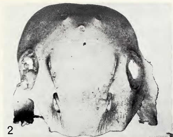
Figure 2. Fossil head capsule of a gynomorph of Dolichoderus taschenbergi , recovered from a layer correlated with a radiocarbon age of 7900 yr. BP. The voucher specimen is deposited in the Institute of Arctic and Alpine Research Quaternary Entomology Collection, University of Colorado.